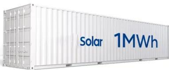
Standard 40ft containers